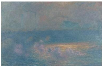
Claude Monet. Waterloo Bridge, Sunlight Effect with Smoke . 1903. Baltimore Museum of Art: The Helen and Abram Eisenberg Collection. BMA 1976.38

Sponsor: This exhibition is supported by the Henry Luce Foundation.