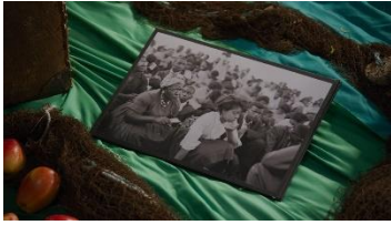
John Akomfrah. Detail of untitled work. 2025.