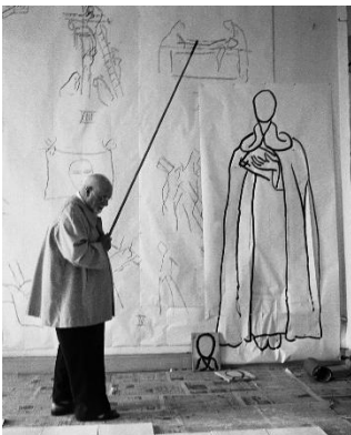
Le grand atelier au Régina. 26 juin 1949. (Henri Matisse drawing with bamboo pole tipped with charcoal in his studio at the Regina in Nice, France, June 26, 1949)