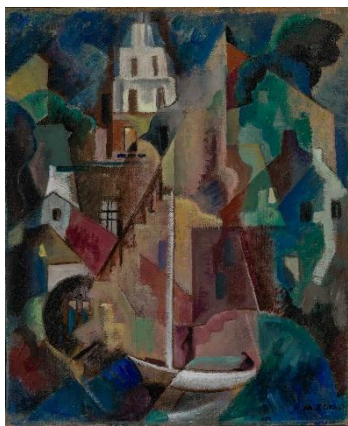
Marguerite Thompson Zorach. Provincetown . 1916. Baltimore Museum of Art, Sigmund M. and Mary B. Hyman Collection. BMA 2025.170