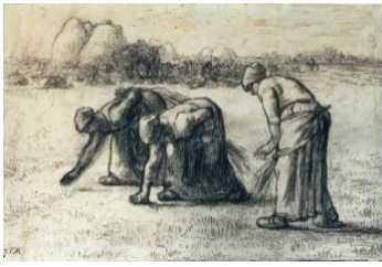
Jean-François Millet. The Gleaners . c. 1855. Baltimore Museum of Art, The George A. Lucas Collection, purchased with funds from the State of Maryland, Laurence and Stella Bendann Fund, and contributions from individuals, foundations, and corporations throughout the Baltimore community. BMA 1996.48.18686