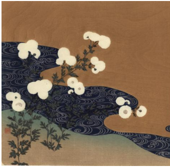
Tsukioka Kogyo. Chrysanthemums beside a Stream . 1900-1910. Baltimore Museum of Art: Straton Family Fund. BMA 2014.50