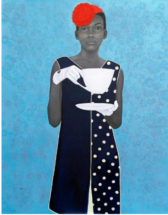
Amy Sherald. Miss Everything (Unsuppressed Deliverance). 2014. Private Collection.