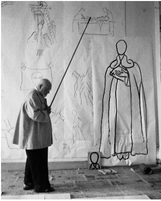
Le grand atelier au Régina. 26 juin 1949. (Henri Matisse drawing with bamboo pole tipped with charcoal in his studio at the Regina in Nice, France, June 26, 1949)