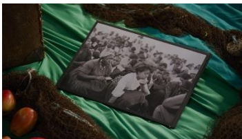
John Akomfrah. Detail of untitled work. 2025.

Tour: The exhibition premiered at SFMOMA in fall 2024 and traveled to the Whitney Museum of American Art in spring 2025.