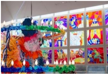
Raúl de Nieves: and imagine you are here installation at the Baltimore Museum of Art, November 2023.