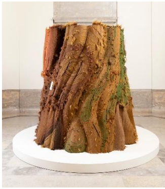
Malcolm Peacock. Five of them were hers and she carved shelters with windows into the backs of their skulls. 2024.