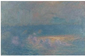
Claude Monet. Waterloo Bridge, Sunlight Effect with Smoke . 1903. Baltimore Museum of Art: The Helen and Abram Eisenberg Collection. BMA 1976.38

Sponsor: This exhibition is supported by the Henry Luce Foundation.