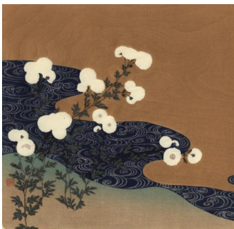
Tsukioka Kogyo. Chrysanthemums beside a Stream . 1900-1910. Baltimore Museum of Art: Straton Family Fund. BMA 2014.50