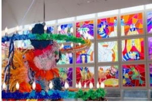
Raúl de Nieves: and imagine you are here installation at the Baltimore Museum of Art, November 2023.