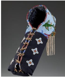
Tom Haukaas (Lakota (Sioux)). Cradle . 1998. © Tom Haukaas.