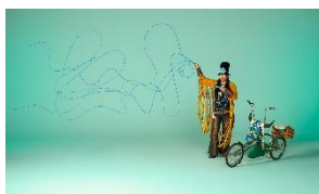
Dana Claxton (Hunkpapa Lakota). Lasso . 2018.

Ortman's original score builds upon, then radically departs from the overwhelmingly white, male canon of classical music—her score samples a classical Mendelssohn piece, which bleeds into an atmospheric and ethereal composition. The pairing of the piece with the Apache fiddle insists upon the ingenuity and enduring community traditions of the Southwest.