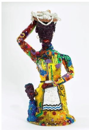
Joyce J. Scott. Dead Albino Boy for Sale. 2021-22.